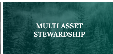
MULTI ASSET STEWARDSHIP

The Lockhart Asset Management range of solutions is designed to utilise the full universe of global investment markets.