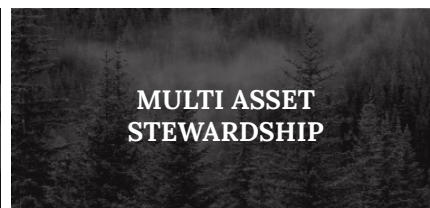
MULTI ASSET STEWARDSHIP

The Lockhart Asset Management range of solutions is designed to utilise the full universe of global investment markets.