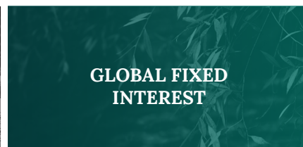
GLOBAL FIXED INTEREST