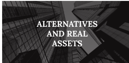
ALTERNATIVES AND REAL ASSETS