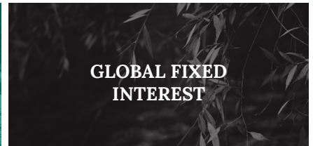
GLOBAL FIXED INTEREST