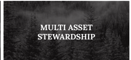
MULTI ASSET STEWARDSHIP

The Lockhart Asset Management range of solutions is designed to utilise the full universe of global investment markets.