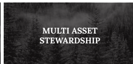
MULTI ASSET STEWARDSHIP

The Lockhart Asset Management range of solutions is designed to utilise the full universe of global investment markets.