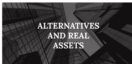
ALTERNATIVES AND REAL ASSETS