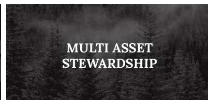
MULTI ASSET STEWARDSHIP

The Lockhart Asset Management range of solutions is designed to utilise the full universe of global investment markets.