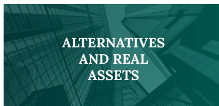
ALTERNATIVES AND REAL ASSETS