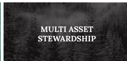
MULTI ASSET STEWARDSHIP

The Lockhart Asset Management range of solutions is designed to utilise the full universe of global investment markets.