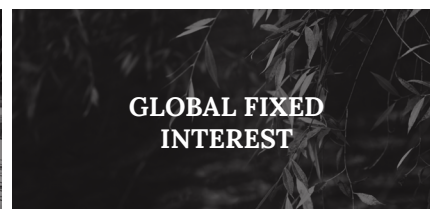
GLOBAL FIXED INTEREST